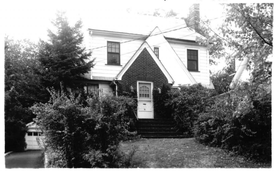
Board of Realtors of the Oranges and Maplewood